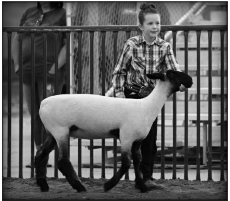
Estimated Start Time: 15-20 Minutes After Conclusion of Youth Lamb / Goat Show